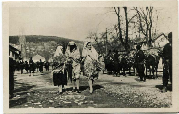
"Sarajevo - Kovači Street"