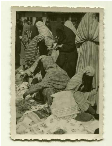
Market scene