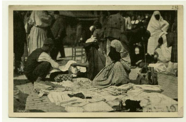
Market scene