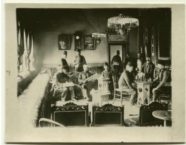
Interior of kiraethane, club and reading room for Muslims