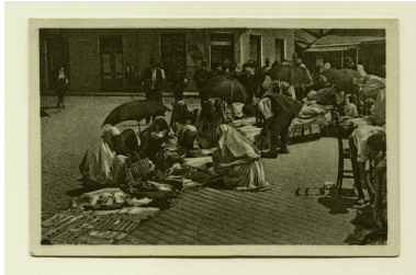
"Sarajevo / Bazar" © Museum of City of Sarajevo