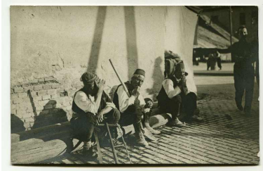
Workspace at Baščaršija