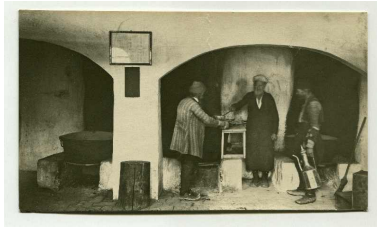
The kitchen of the Gazi Husrev Bey's Madrasa