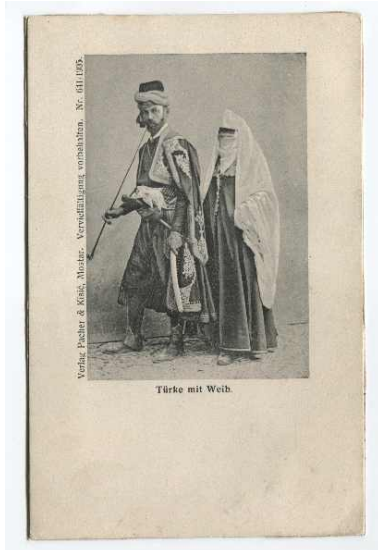
"Turk With His Wife"