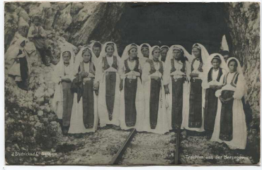
"Folk Costumes From Herzegovina"