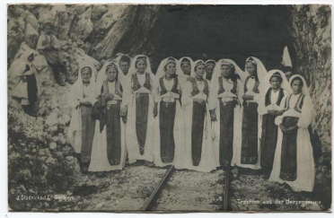
"Folk Costumes From Herzegovina"