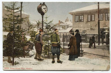
Christmas trees sale