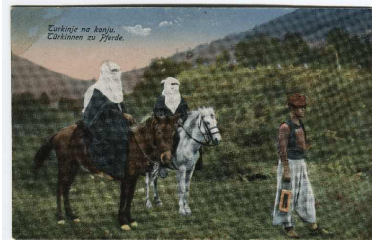
"Turkish Women On Horses"