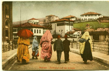
"Bosnia - Turkish Women On The Street"