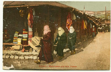
"Bosnia - Market Scene And Turkish Women"