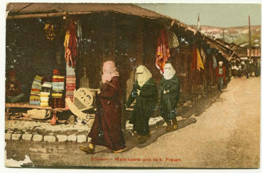
"Bosnia - Market Scene And Turkish Women"