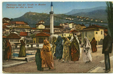
"Turkish Women On The Street In Bosnia"