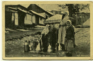
"Sarajevo / At The Fountain"