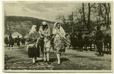
"Sarajevo - Kovači Street"