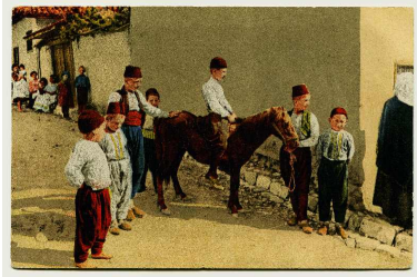
"Sarajevo. Street Market In The Muslim Quarter"