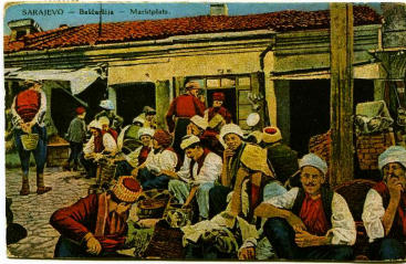
"SARAJEVO - Baščaršija - Market Place"