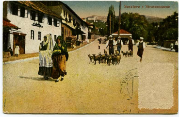
"Sarajevo = Street Scene"