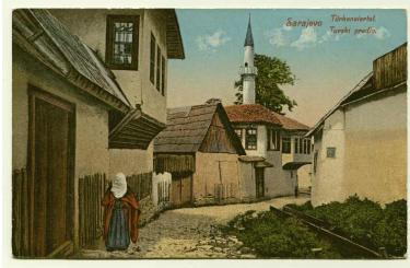
"Sarajevo / Muslim Quarter"