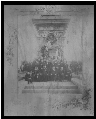
Opalchentsi-pobornitsi (volunteer combatant) in front of the monument of Bulgaria's National Hero Vasil Levski