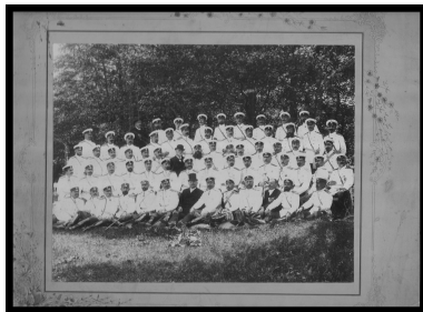
General Danail Nikolaev and officers