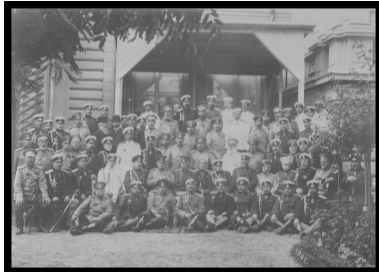
"Commemoration of the 25. Anniversary of the Liberation of Bulgaria"