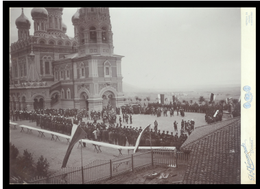
Public prayer in the grounds of the Shipka Monastery