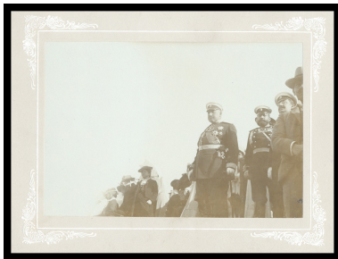
Earl Nikolay Ignatiev with officers and civilians