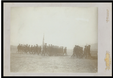
Parade march of "opalchenetsi-pobornizi" ("volunteer combatant")