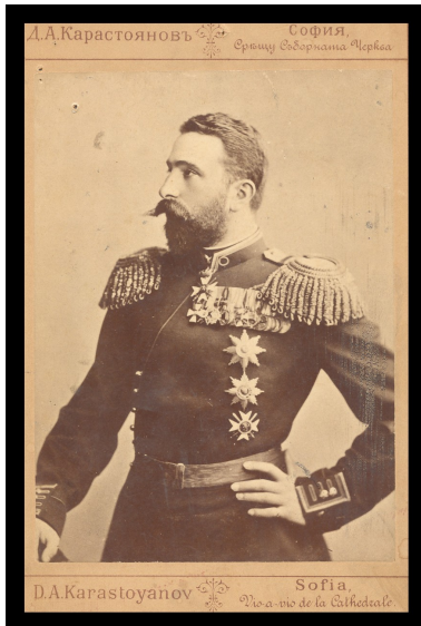
Prince Alexander of Battenberg