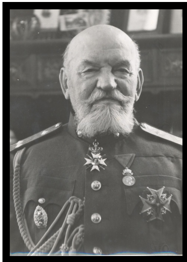
General Danail Nikolaev