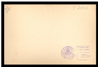
"Museum of the Bulgarian Renaissance"