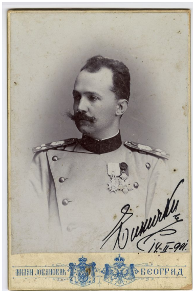
Studio portrait of Stanislav Binički