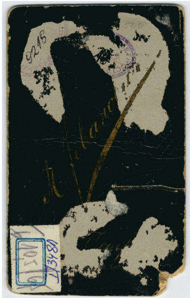
Studio portrait of Branislav Nušić