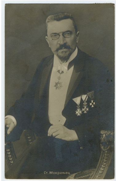
Studio portrait of composer Stevan Mokranjac