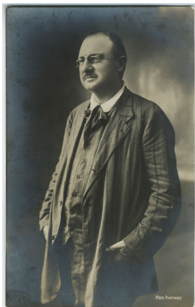
Studio portrait of poet Ivo Ćipiko