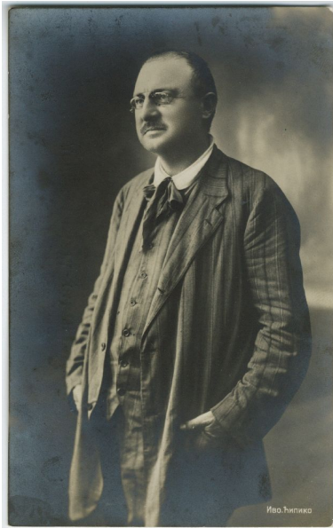
Studio portrait of poet Ivo Ćipiko