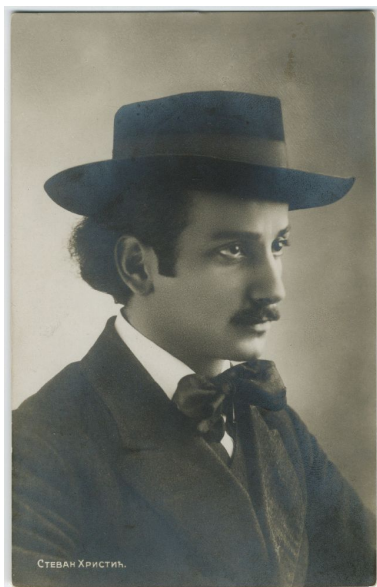
Studio portrait of Stevan R. Hristić