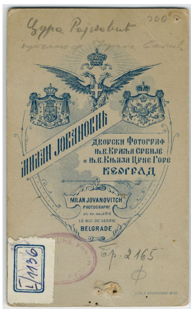
Studio portrait of producer and director Đura Đurka Rajković