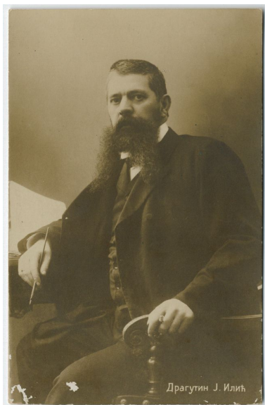
Studio portrait of poet Dragutin J. Ilić