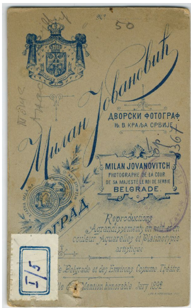
Studio portrait of Toša Anastasijević