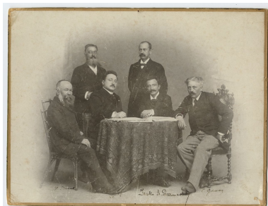
Group shot of the "Literary and artistic committee of the Royal National Theatre in Belgrade"