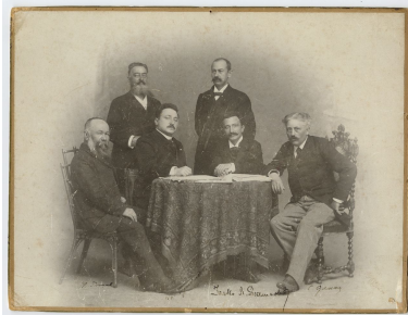
Group shot of the "Literary and artistic committee of the Royal National Theatre in Belgrade"