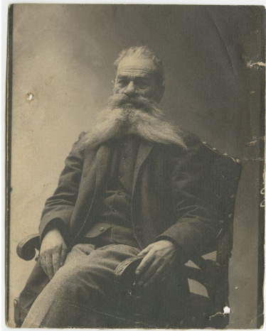
Studio portrait of Jovan Dragašević