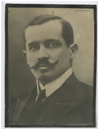
Head and shoulder shot of Dr. Jovan Skerlić