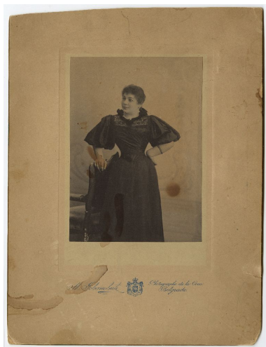
Framed studio portrait of Zorka Todosić