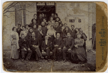
Group shot of artists celebrating Davorin Jenko's birthday