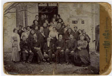
Group shot of artists celebrating Davorin Jenko's birthday