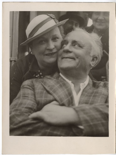
Outdoor photograph of actress Žanka Stokić and actor Dobrica Milutinović