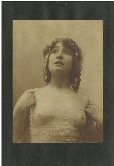
Studio portrait of actress Olga Ilić