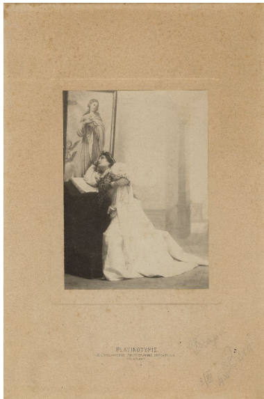
Framed studio portrait of Vela Nigrinova