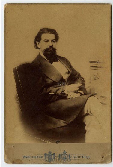
Studio portrait of Milorad Šapčanin