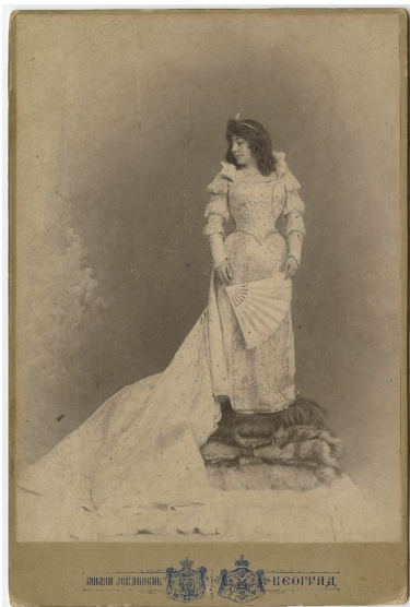
Studio portrait of actress Zorka Todosić in character as 'Bettina', the mascot