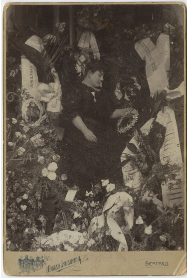
Portrait of Zorka Todosić