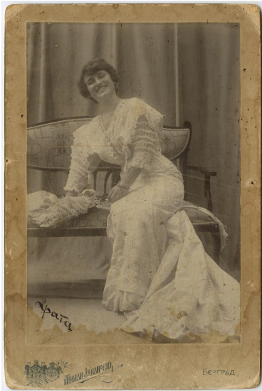
Studio portrait of Draga Spasić