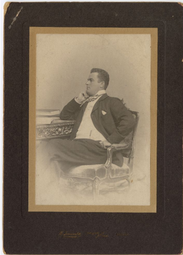
Studio portrait of Milorad Petrović